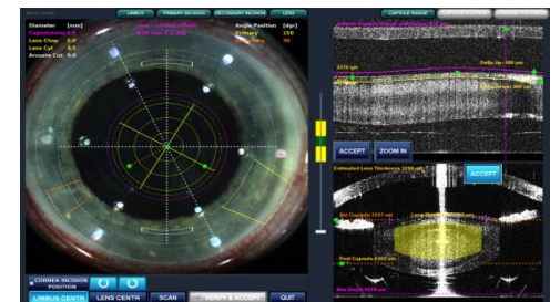
Femtosecond laser screen image showing corneal incisions and lens fragmentation pattern as well as OCT image of the cornea and lens.

Today, phacoemulsification is the most common cataract procedure. It is an outpatient procedure that takes five to 15 minutes. Patients usually return to their normal activities 24 hours after surgery, but may require help immediately following their surgery and during those first 24 hours as they recover.