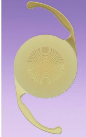
ReSTOR®: An advanced multifocal intraocular lens.

The patient benefits include more reproducibly consistent and stable incisions, which facilitate faster healing, are more secure and have less risk of leaks and infection. 1 The femtosecond laser is also able to create a near perfect, round opening in the anterior capsule. 2 This has several benefits over a manually created capsulotomy. The primary benefit is the ability to recreate the exact same size capsule opening every single time, which improves the estimation of the final position of the lens implant in the eye – the Effective Lens Position (ELP). This improves the surgeon's ability to accurately calculate lens implant power.